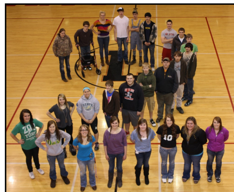
Liberty's class of 2012 will graduate June 2.