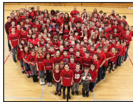
Students wear "Rock the Beat" t-shirts for National Wear Red day.

"Rock the Beat" t-shirts were sold for $10 each as a fundraiser for the American Heart Association, and the students raised