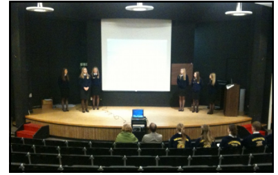
Liberty's Ag Issues team earned a 1st place finish at sub districts.