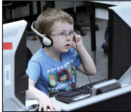
Funding from voter-approved technology levies has allowed Liberty to build & maintain state-of-the-art computer labs.

The Liberty School District will be seeking to pass a three-year replacement M&O levy on the February ballot. This critical measure for the district provides 28 percent of the operating capital in the general fund and comes directly from taxpayers within our district boundaries. Without local levy support, many of our programs would be eliminated, and class sizes would increase significantly.