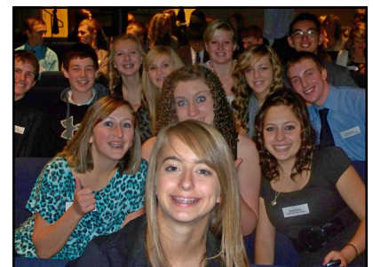
Thirty-one FBLA students attended the fall conference in Spokane.

The FBLA holds weekly meetings at lunch to learn about fundraising, future competitions and school. Thirty-nine students plan to attend the FBLA Winter conference in February. Students will compete in various competitions to qualify for the State Business Leadership Conference in April.