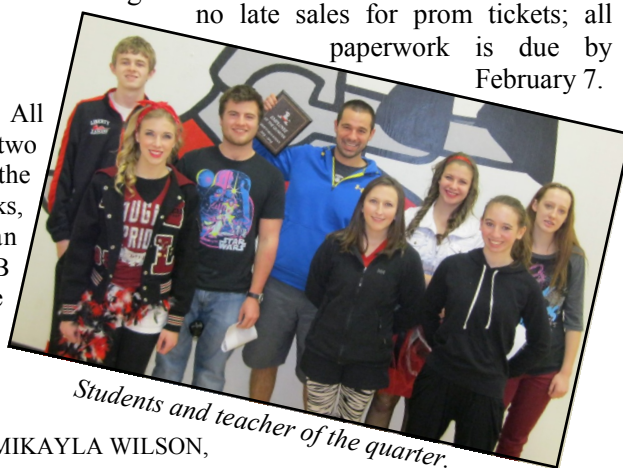
Students and teacher of the quarter.