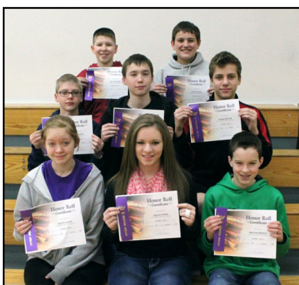
8th graders earning a 4.0 GPA term 2.