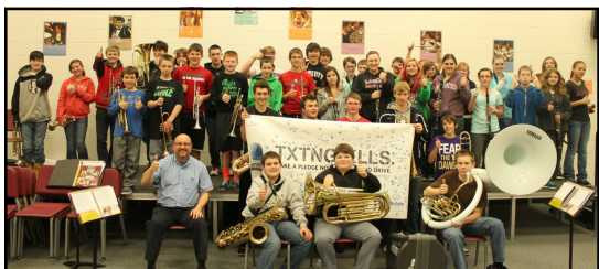
Band students proudly display their thumb bands.